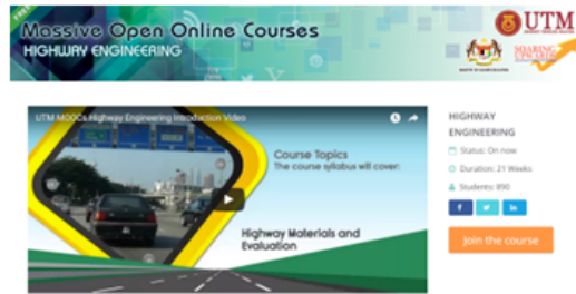
Figure 3. Screen shot of the Lecture videos from SKAA 2832

The assessments used in MOOCs consist of course activities and examinations. They