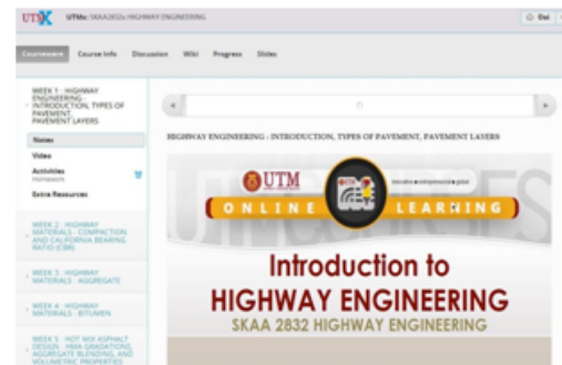
Figure 1. Screen shot from SKAA 2832 with navigation bars on the left

Most MOOCs still use the lecture as the main medium (Pappano, 2012) of instruction in addition to assessments and social networking. Figure 1 shows the screen shot from "Introduction to Highway Engineering" (SKAA 2832), one of the MOOCs of UTM with navigation bars on the left.