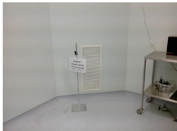
Figure 2: Placement of the instrument in the operating room

measurement. During the measurement, surgical procedures and other activities were conducted as usual.