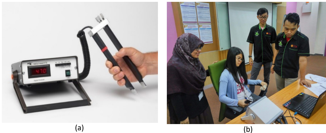
Fig. 3. (a) Digital grip / pinch analyser from MIE Medical Research Ltd. [21] and (b) position of the subject during the hand grip strength measurement