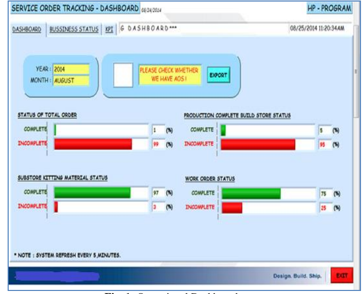
Fig. 1: Operational Dashboard

From the interview sessions conducted with the staffs from the operation section of the Manufacturing firm, their feedback was obtained. Their feedback was gathered on the amount of time saved by using the dashboard as compared to the previous manual method they were using. The type of data they were analysing is the orders data for one month period. Brief details of the interview session and the summary of their feedback are tabulated in Table 2 and Table 3, respectively.