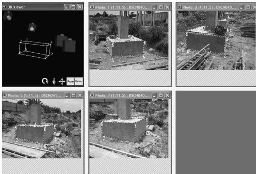
Figure 2. Sample screen of marking on reference points and 3D viewer with camera icon of the construction of pile cap

When these calculations are finished the user returns to the referencing phase. At this point, automatic helper tools are available to speed up the process. These tools appear as a result of the initial processing of the data, which yields the spatial location and orientation angles of the cameras. Now the images are said to be oriented. In a typical PhotoModeler project without control points especially points with known co-ordinates, the camera locations and orientations calculated above are relative quantities with respect to camera. At this point it is good idea to verify that the software positioned the cameras properly, which can be checked easily in the graphical 3D viewer available in PhotoModeler. The viewer shows small camera icons at their locations and orientations relative to targets with calculated 3D co-ordinates, displayed as small dots. Controls are available to rotate or resize the 3D graphic for better viewing as shown in Figure 2.