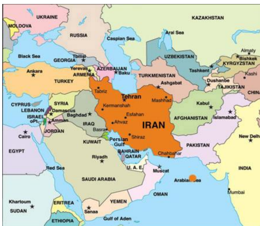
Figure 1.1 The map of Iran in the Middle East

However, there was a 25 percent increase in the number of foreign tourists from 2011 to 2012, which is a very high rate of growth (ICHTO, 2013).