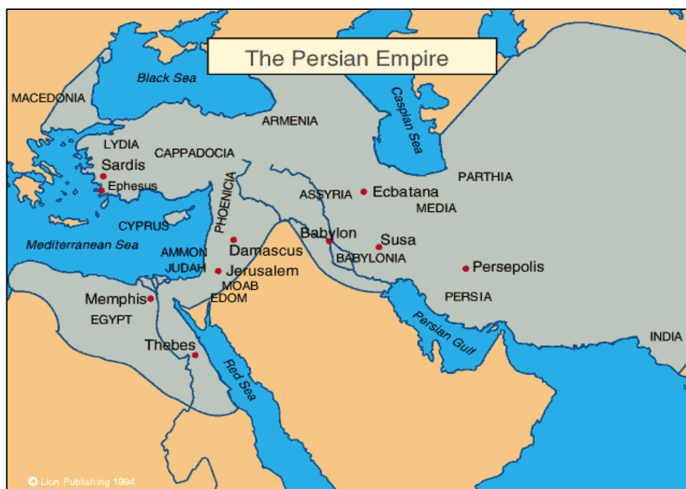
Figure 1.3 Territory of Persian Empire

Archaeological evidence indicates that this region became a human shelter 40,000 years ago. Its primary monument is the Bistoon Inscription, made in 521 BC by Darius the Great when he conquered the Persian throne. The inscription is written in 3 languages: Elamite, Babylonian and Old Persian (UNESCO, 2006). It represents the victory of Darius the Great over Gaumata and nine rebellious kings and covers an area of about 20 meters by 10 meters. There is no doubt that this is the most important document of the ancient Near East (Zolfaghari et al., 2005). There are Achaemenid (550–330 BC) inscriptions and reliefs carved in Bistoon cliff, which attract the attention of tourists and passengers to the delicate artistry which was used in carving these historical relics.