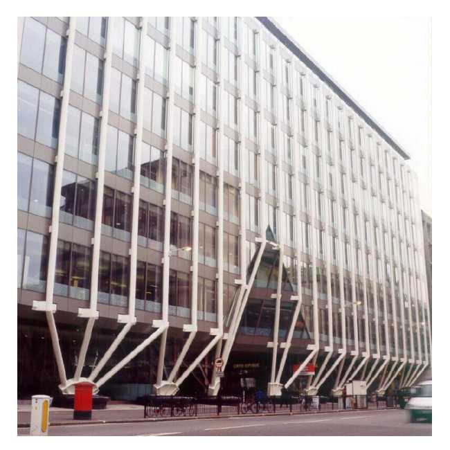
Figure 1.3 Fleet Place House (London, UK)