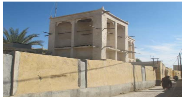
Figure-1. Wind catcher in the northern coast of Persian Gulf (Iran, Laft).

in central cities of Iran with hot, dry climate and also in hot, humid areas of southern Iran (Figure-1).