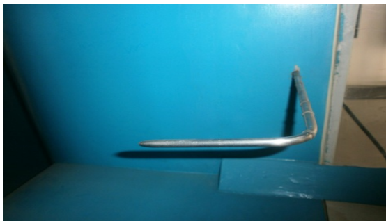
Figure-5. Free stream pressure sensor installed inside the wind tunnel.

The pressure transducer had 30 inputs, from which only one was used to connect the free stream pressure sensor installed inside the tunnel (Figure-5). Tap number 18 was not been connected to the pressure transducer because of the sensor limitation.