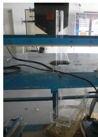
Figure-3. Wind tunnel test (small test section).

At this stage only a part of the model was set up in the test section up and the rest of the model was located outside the wind tunnel (Figure-3) in order for the airflow to only affect the small body part of the wind catcher inside the test section. In this case, according to the mechanical principles, Bernoulli's, while a part of model is located inside the test section and the rest outside the test section, the flow around the wind catcher inside the test section makes the suction flow taking the air inside the model, leading a flow from lower levels to upper levels. In this case, the objective was to find out the behaviour of flow and examine the results of CFD simulation and Compare them with data recorded (pressure coefficients on the inner sides of model were measured) from experiment which inside the small test section.