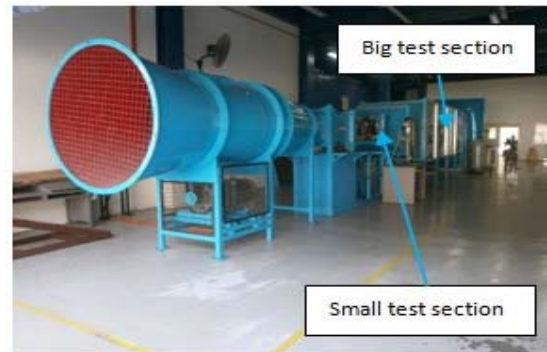
Figure-2. Wind tunnel in aeronautic laboratory of University Technology Malaysia (UTM)

First series of experiment were done using made models by Plexiglas in different dimensions at height and in area which included a house (The typical layout of unit of the basic simplified configuration of single buildings in high- rise low- cost residential building) and the wind catcher.