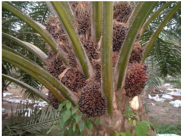
Figure 9 (a) Oil Palm after treatment by ADOPSY™, eventually increase numbers of FFB

This case study also indicates that the increase of crops by quantity will of course increase in yield. Plantation operators normally measure the quality of FFB. The quality of FFB is subjective to land area of plantation and also varies according to management point of view. Management decides on usage of any type of fertilizer, pruning intervals and so on. This case study has successful materialized the tangible finding by increasing the quantity of fresh fruit bunch. The increased in terms of the numbers of fresh fruit bunch produced by the plant after the ADOPSY treatment, are also depicted by sample of plant in Figure 9(a) and Figure 9 (b).