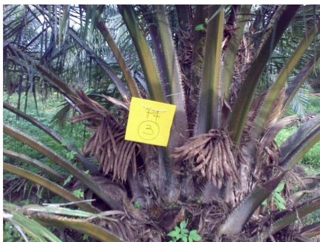
Figure 2 Inflorescences were turned into abortion instead fruit bunch