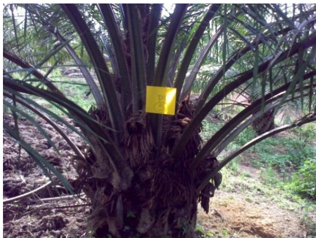
Figure 1 Aborted anthesis in Oil Palm

This applied research base on case study was conducted to prove that the decreasing potential yield was because of lack of pollination activities in plantation area due to low population of weevil. The valuable weevils were not appearing for pollination task effectively hence cause to low yield. Yield is calculated by weight (quality) multiply by numbers (quantity) of fresh fruit bunch, and this case study research also determined the quality of fresh fruit bunches that are produced by adopting ADOPSY™. The element of controls for examples, fertilizer, and plantation maintenance are considered constant. Figure 1 shows common view of aborted anthesis in oil palm plantation due to lack of pollination activities and Figure 2 shows numbers of inflorescences were turned into abortion instead fruit bunch.