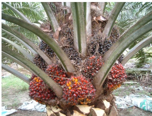
Figure 9 (b) ADOPSY™ is mean artificially increase pollination activity