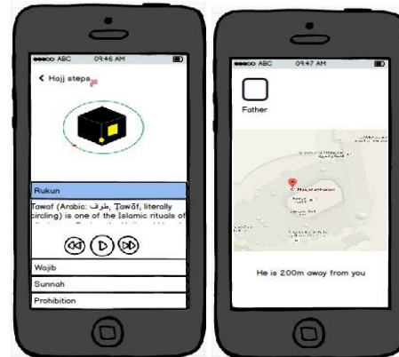
Figure-2. Screenshot of the application's tracking and guidance features.