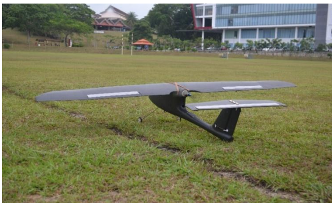
Figure 1 Helang UAV

Classically, GCP is determined by using rapid static technique where the observation take 5 to 15 minutes for every point, radically. Radically means, the point is observer as its own direct to base point and no connection to other points. By applying this technique for establishment of GCP, an accuracy of tens of centimeter level can be achieved.