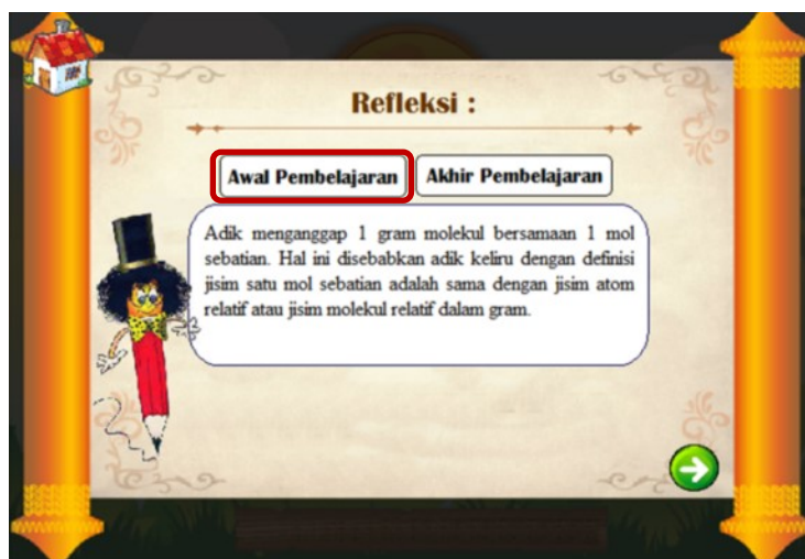
Figure: Display of Early Reflection of Learning