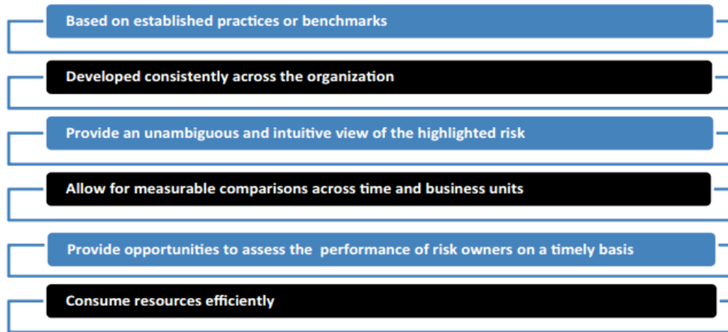
Figure 3: Expected Responsibilities of Boards of the Organization