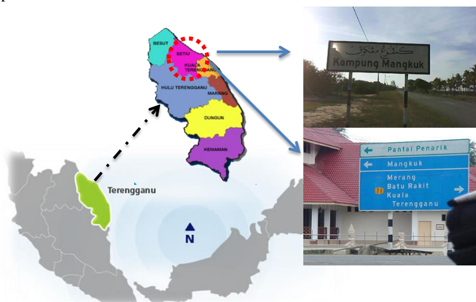
Figure 1: Kampung Mangkuk, Setiu, Terengganu

From the capital town of Setiu, journey by car and motorcycle will bring us to the coastal village of Kampung Mangkuk, which is have a harmony community like malays, chinese and a litle bit of indian community. But majority of the community are dominated by malays community is which three quarter of community in Kampung Mangkuk, Setiu is engaged in fishing and agricultural industries while the rest are self-employed businessmen, and others village job. Since the local economy is mainly based on fishing, Kampung Mangkuk is famously known with the marine based products and naturally like Small Medium Enterprises (SMEs) products.