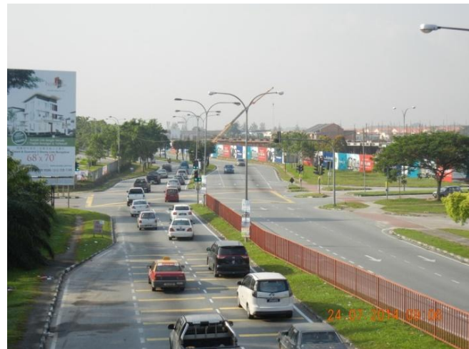
Figure 1 Layout one of the intersections studied (Site B)