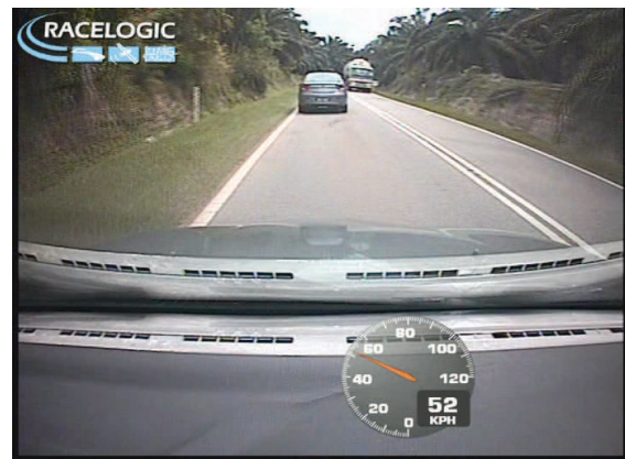
Figure 1: Typical Video Display during Playback

To explicitly portray the potential of the proposed method for estimating time headway, the parameter was measured using both spot and suggested approach simultaneously, described as follows. To achieve that, specific observation points were selected on each of the roads along a demarcated 3.5 km segment at which two observers were stationed. One of the observers record the time interval between the passages of a randomly selected lead vehicle and the test car based on arrival time using a stop watch; and the value taken as the spot time headway. At the same time, as soon as the rear of the lead vehicle crossed the reference point, an indication was made by the second observer by raising a flag which is noted by another observer inside the test car during which he voiced out the occurrence for audio recording onto the VBox. Moreover, the flag indication is also seen in the video display during playback. At that moment, the width of the lead vehicle is measured and based on the class of the lead vehicle; the space headway is estimated from the established relationship. The estimated space headway at that instance is then used in relation to the test car speed at that moment to compute the time headway. The procedure was repeated until a reasonable number of observations were made to ascertain the consistency of the estimates or otherwise. Figure 1 depicts a typical video display during playback; showing a lead vehicle and part of test car.