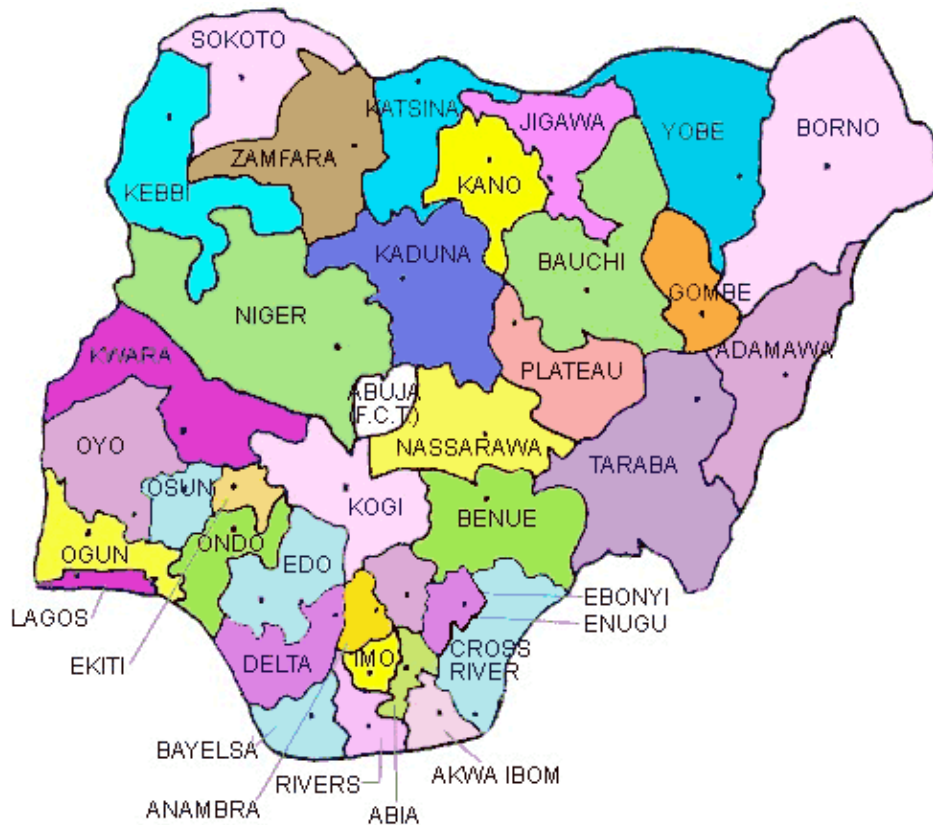
Figure 1: Nigeria showing FCT Abuja

The area is characterized by a hilly, dissected terrain and is the highest part of the FCT with several peaks that are 760 m above sea level (Balogun, 2001). The geology of the area is underlain by basement complex rocks. The annual rainfall is highest within the FCC and its environs which is about 1,631.7 mm. The annual mean temperature ranges between 25.8 and 30.2°C (Adakayi, 2000; Balogun, 2001). The soils of the study area are basically Alluvial and Luvisols. The FCC is rich in infrastructure such as expanding road network, drainage and sewage systems, and piped water.