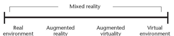
Figure 1 Reality-Virtuality Continuum by Milgram et al. (1994; as cited by Azuma et al., 2001).

The enabling technologies for AR as indicated by Azuma et al. (2001) include the displays, tracking, registration and calibration systems. Rabbi et al. (2013) from another perspective perceived these as