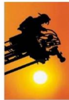
Figure 5 Example of processed images

The types of forgeries described in this subsection and the next do not necessarily fall into the traditional definition of image tampering i.e. there is no addition or hiding of information. However, as in the case of the image tampering discussed in this subsection, the reality portrayed by an image processing operation can be distorted at a psychological level. Samples of such tampering are shown in Figure 5.