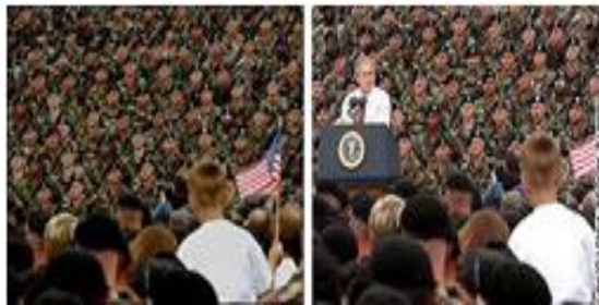
Figure 3 Example of copy-move forgeries

Another common type of image forgery is the copy-move (or region duplication or cloning) forgery. In this type of forgery, regions from the same image are copied and pasted (with possible transformations) in the same image. This is usually done with the intent of hiding certain content present in the original image or duplicating certain content not actually present in the image. Some examples of copy-move forgeries are shown in Figure 3.