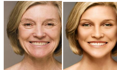
(a) Original Image (b) Retouched Image

Image Retouching can be regarded to be the much less harmful type associated with digital image forgery. Image retouching does not really considerably modify an image, however rather, improves or even decreases certain feature of an image (see Figure 4). This method is well-liked by magazine photo editors. It can probably be asserted just about all magazine cover would utilize this technique to improve particular features of the image so that it can be more attractive; disregarding the truth that this kind of enhancement is morally wrong.