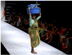
A picture of a woman superimposed on a fashion-show catwalk stage