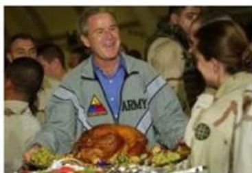
Figure 6 Example of false captioning images

The last type of image forgery that we discuss is probably the least like the other three types seen so far. In false captioning it is possible that the content of the image is not touched at all, but the caption of the image, which provides context, is changed from the actual situation with intent to mislead the viewer or reader. Examples of images where false captioning has been used are shown in Figure 6. Apart from actual image captions, other informative elements like metadata (which can provide geographical or temporal context), may be tampered without changing the image content. Such tampering also falls within the category of false captioning.