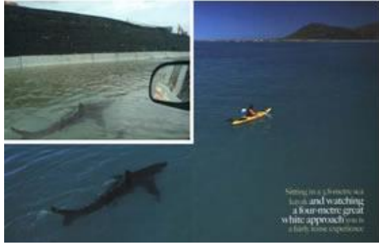
Figure 2 Example of sliced images

Figure 2 shows a hoax image that surfaced right after flooding in Puerto Rico caused due to Hurricane Irene in 2011. The inset image shows a shark swimming down a flooded street, but is a hoax with the shark likely digitally inserted from the larger image published in a 2005 issue of Africa Geographic .