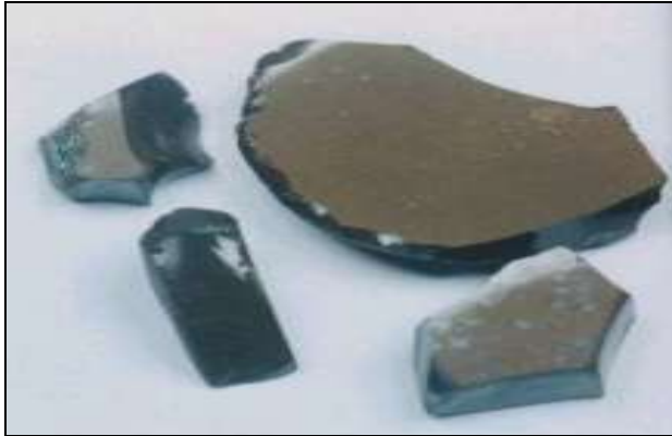
Figure 1 Sewage sludge molten slag from high temperature melting treatment [7]

Molten slag produced by a slow cooling rate (less than 5°C per minutes) was found to exhibit the lowest heavy metals contents in the leachate [7]. Figure 1 shows the molten slag samples that have been produced from the high temperature melting treatment. Past studies have indicated that high temperature melting treatment could convert sewage sludge into products that can be either reused or land filled without adverse environmental effects [5]. This paper will focus on the possible utilization of sewage sludge molten slag as aggregate substitute in asphalt mixtures for pavement construction.