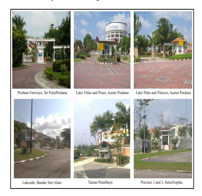
Figure 2 GACOS built by Private Housing Developers in Southern Johor, Malaysia

Physically, GACOS are mainly characterised by the gate, the security guard and fabricated perimeter fencing as their enclosure components as in Figure 2.