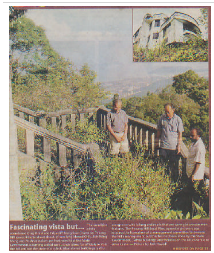
Figure 1.2 : The New Sunday Times reported on 19 th September 2004 about an abandoned bungalow, the Crag Hotel in Penang Hill. The Crag Hotel built by the famous Armenian hoteliers, The Sarkies Brothers. After government leased the building to the Uplands School (International School of Penang) until 1977, the building been neglected. In 1999, the site became a location for the Oscar-winning French film “Indochine”. (Detailed report on Appendix A).

The composition of Penang Hill's atmosphere has greatly changed since the end of the colonial period (Aiken, 2002; Peng, et al, 1991). Penang Hill itself has changed very little over the past fifty years or more (Aiken, 2002). As reported on several newspapers (Figure 1.2 and Appendix A) which witnessed that several bungalows were abandoned and need to be repaired or required a complete rehabilitation.