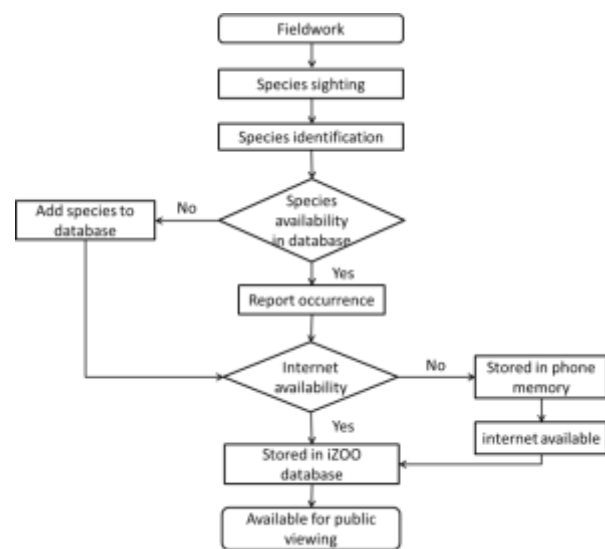
Figure 1 iZOO mobile data flow

content button. For species readily available in database, the occurrences of specimens of species is reported. Species availability is checked by selecting species taxonomic class and filling in species name in the autocomplete search engine. Location of the occurrences is submitted by utilizing the automated built-in Global Positioning System (GPS) in the device. This information will be displayed as a pin on location map of the particular species in the website in near real-time. In both situation, camera feature can be activated and specimen images can be submitted along with species data and geolocation. This simplifies the reporting process of digitizing data and cross matching image data to species data. Submission's timestamp and user information is automatically recorded for data track record. Data flow of iZOO mobile is as shown in Figure 1.