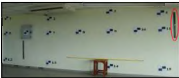
Figure 1. Test points established at calibration field.

In order to investigate the significant of self-calibration to improve the accuracy of TLS data, photogrammetry technique was utilised to establish fifteen test points (figure 1). As mentioned by Luhmann et al. [1], industrial or close range photogrammetry can provide less than millimeter accuracy, which has justified this measurement technique to be selected for determination of true values for those test points.