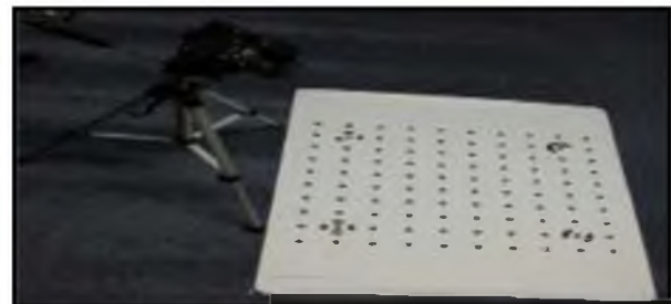
Figure 2. Calibration of Sony DSC F828 camera.

In this study, Sony DSC F828 digital camera was employed to capture the images of test points. As a routine procedure, the camera should be calibrated before can be used for 3D measurement purposes. Figure 2 has shown the calibration procedure carried out for digital camera Sony DSC F828 and the processing of the calibration parameters was made with the aid of Photomodeler V5.0 software. To evaluate the accuracy of 3D coordinates of test points whether good enough to be considered as true value, several scale bars were positioned at the measurement field. One of the scale bar with red ellipse as depicted in figure 1 is used to investigate the accuracy of 3D test points yielded from photogrammetry technique.