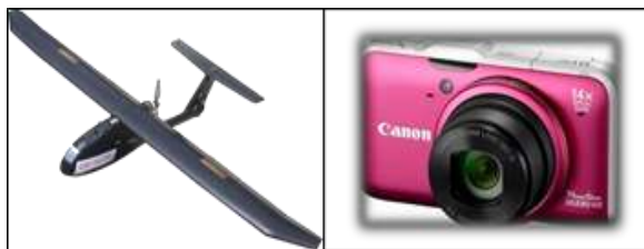
Figure 1 (a) Micro fixed-wing UAV; (b) Compact digital camera

Therefore, this study used two main hardware for image acquisition which is the micro fixed-wing UAV and high resolution digital camera. Low altitude UAV is preferable in this study because it focuses and only covered a simulation model in a small area. The compact digital camera provides small format images. Figure 1 show the example of UAV (Hexacopter) and compact digital camera used in this study.