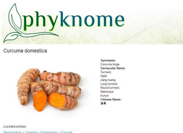
Figure 3 Featured plants showing exemplar species pages