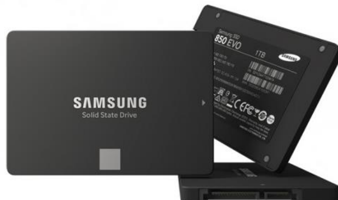
Figure 1.2 Samsung unveil SSD using its new 3-bit V-NAND storage technology

BY FARHAN · 2 DAYS AGO · 4 COMMENTS · 2.1K VIEWS