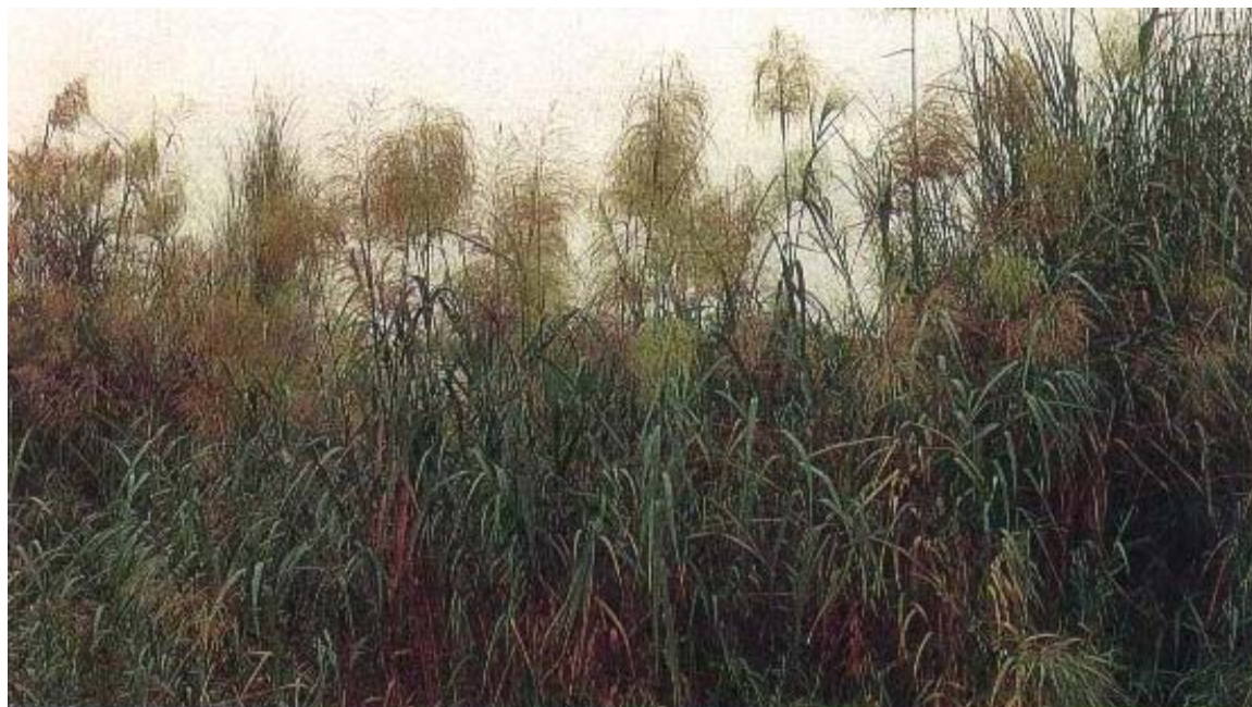
Figure 1.2 Phragmites karka growing naturally by the river bank