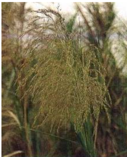
Figure 1.3 Close-up of inflorescence of Phragmites karka