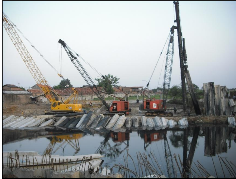
Figure 1.1: Riverbank protection work on the Normalization of Mookervart River Project, Jakarta

Figure 1.1 shows one of the methods of work of river banks protection, namely the erection to the right and left banks of the river. This method is currently use in Indonesia. This figure was obtained from the author's experience working directly in the normalization of the river project Mookervart, Jakarta (2009). This cliff reinforcement method using concrete sheetpile materials erection that at stake by using pile driver machine to a depth that is specified. This method of reinforcing is suitable to hard ground and for main river that need large of river discharge.