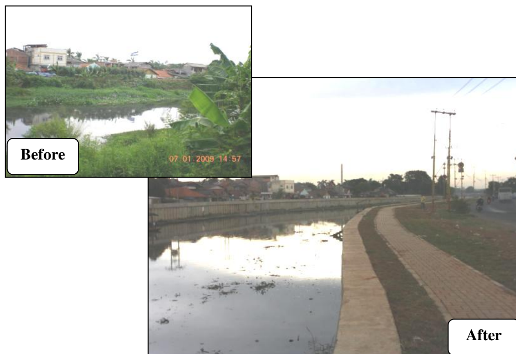
Figure 1.4: Finished work on the Normalization of Mookervart River Project, Jakarta (2009)

Figure 1.4 is show the condition after finished work on the river normalization project i.e. Normalization of Mookervart River Project, Jakarta, 2009. The river has been widened, the river banks has been reinforced, and the riverbed has been dredged, so that comply with design discharge also the river channel capacity and its ability to convey water has been increase for flood alleviation purposes.