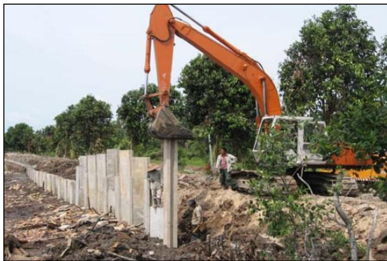
Figure 1.2: Riverbank protection with Wellguard pre-cast retaining wall (Yii Hing, 2007)

Figure 1.1 shows one of the methods of work of river banks protection, namely the erection to the right and left banks of the river. This method is currently use in Indonesia. This figure was obtained from the author's experience working directly in the normalization of the river project Mookervart, Jakarta (2009). This cliff reinforcement method using concrete sheetpile materials erection that at stake by using pile driver machine to a depth that is specified. This method of reinforcing is suitable to hard ground and for main river that need large of river discharge.