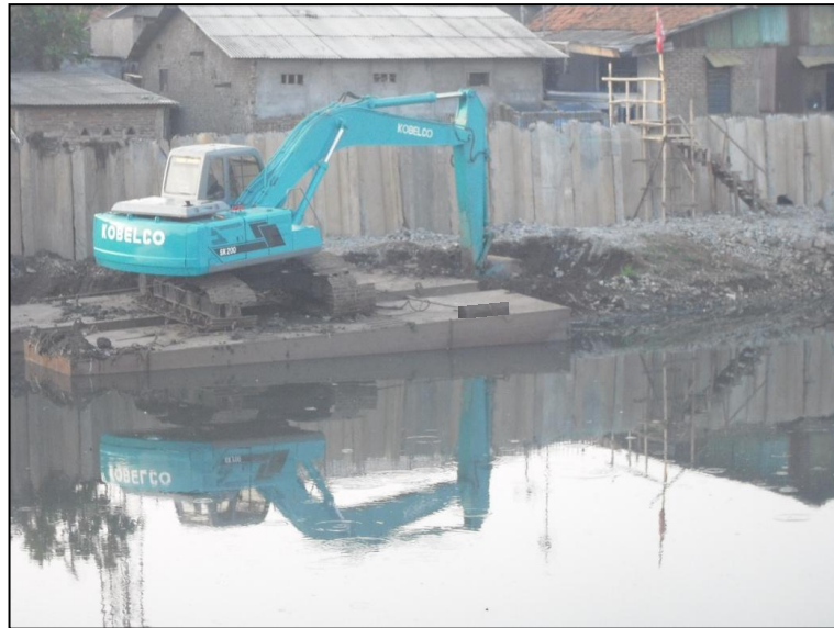
Figure 1.3: Dredging of the Riverbed by Pontoon Excavator

Figure 1.2 show one of the technology use of river normalization project using WELLGUARD pre-cast retaining wall. WELLGUARD pre-cast retaining wall is one of alternative retaining structure that currently used in Malaysia. Previously, several types of the retaining structures for slope protection have been introduced e.g. steel sheet pile and concrete reinforcement retaining structures etc.