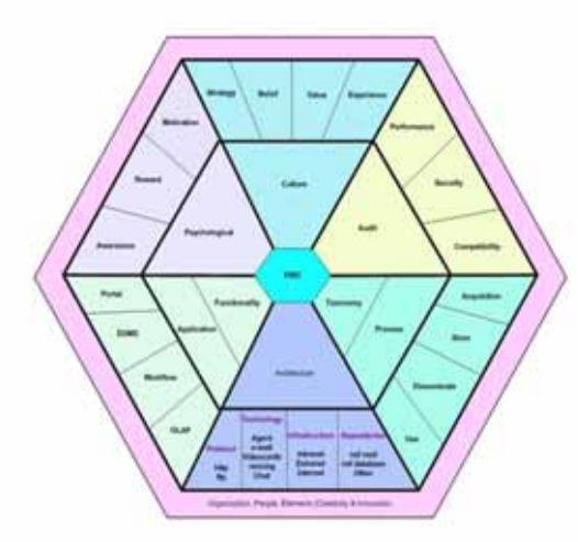
Figure 4: The Modification of KMS Model

The revised KMS model and its architecture has been made because there are other components that should also be considered such as the taxonomy component with related to the knowledge repository, the detailed specification on technique, and technology involvement in a collaborative environment. So, we have proposed the new KMS model and architecture for LO that consists of six main components in order to serve community of KMS with collaborative environment to work together for a certain mission in the organization. These components include: Architecture, Functionality and Application, Taxonomy and Process, Culture, Psychological and Audit, so called AFTPCAS Model are identified as a KMS architectural framework for a collaborative environment in the LO. The connectivity of the multiple issues and aspects plays a major role in KMS model and architecture after modification as the outcome of research is shown in Figure 4 and Table 2.