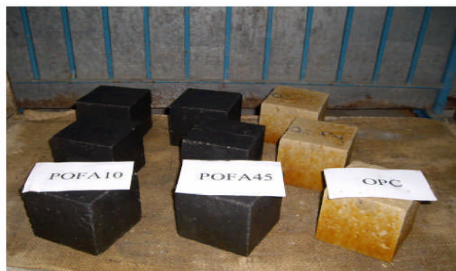
Figure 1. Specimens before exposed to acid solution Figure 2. Specimens after exposed to acid solution