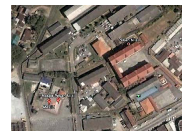
Figure 3 Nilai Town Mosque, Negeri Sembilan