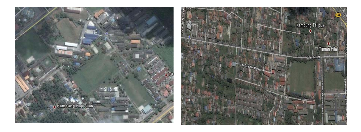
Figure 11 Makmuriah Mosque, Sungai Besar, Sabak Figure 12 Telipot Mosque, Kota Bharu, Kelantan Bernam