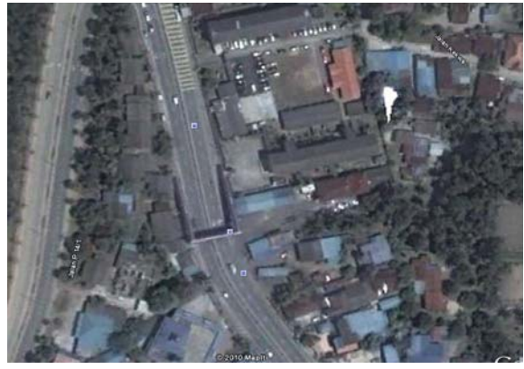
Figure 6 Abu Bakar Baginda Moque, Sepang, Selangor