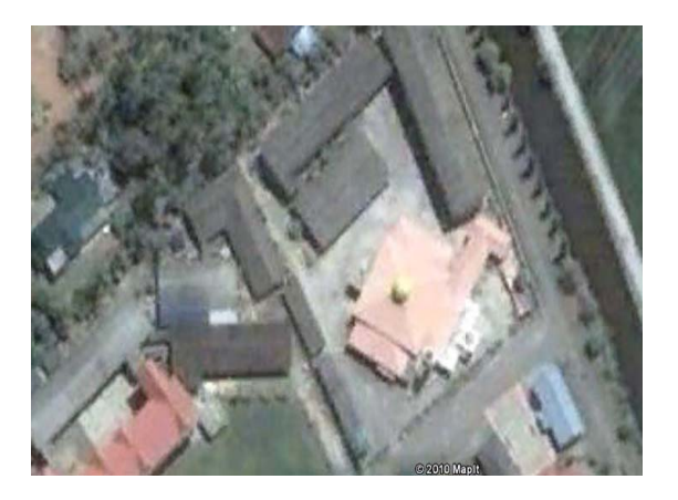
Figure 5 Sungai Limau Mosque, Sungai Besar, Selangor