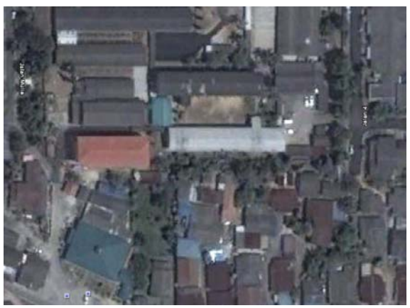
Figure 2 Istiqomah Mosque, Sg. Merab, Selangor