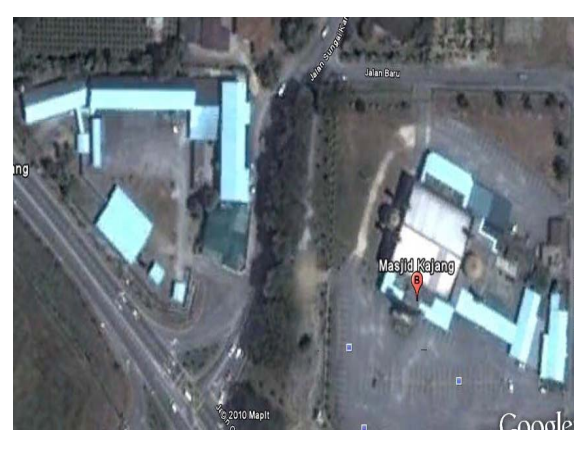
Figure 4 Kajang Mosque, Selangor