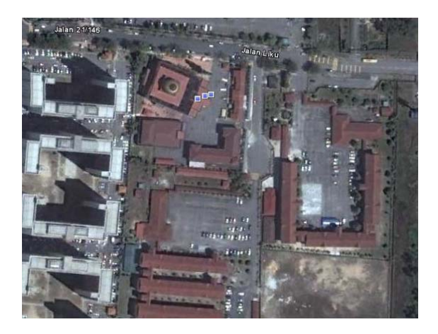
Figure 1 al-Muqqarabin Mosque, Bandar Tasik Selatan, Kuala Lumpur