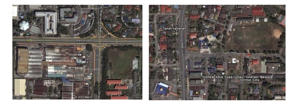
Figure 9 Petaling Mosque, Petaling Jaya, Selangor