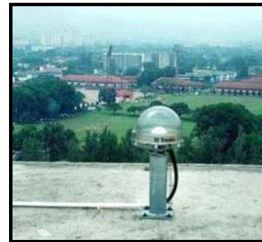
Fig. 2 Example of one of the MASS station established at JUPEM's building in Kuala Lumpur.