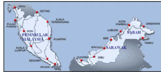
Fig. 1 Location of MASS stations in Peninsular Malaysia and Sabah and Sarawak.

The network of the MASS stations is remotely operated and managed from the Geodetic Data Processing Centre, Geodesy Section, DSMM, Kuala Lumpur. Each MASS station records in TRIMBLE proprietary formats and converts to RINEX with the Coarse Acquisition (C/A) code, P/Y code, L1/L2 carrier phases observable. The data format for all MASS stations is supplied in one-hour blocks with either in RINEX format or DAT format files.