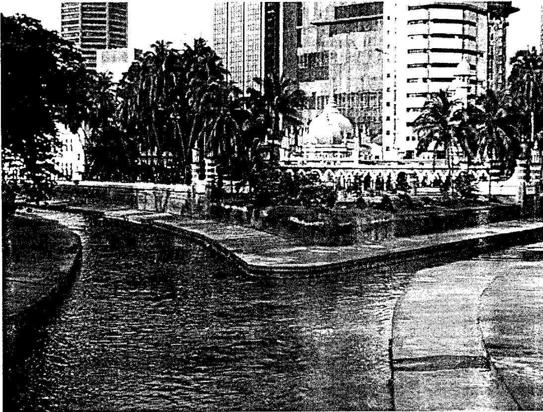
Plate 2: The Klang River runs right through the Federal Capital of Kuala Lumpur, one of the most urbanised and densely populated regions in the country.

A total of eight sub-programs were established, each to be carried by one or more agencies. The Sub-Programmes were construction, maintenance and desilting under the jurisdiction of the DID, beautification under the Kuala Lumpur City Council (DBKL), education, enforcement and water quality monitoring under the DOE, rehabilitation of aquatic life under the Fisheries Department, and the treatment of wastes from animal husbandry by the DOE ( http://agrolink.moa.my/did/river/sgklang/klang_basin.html ). Due to rapid development of upstream areas, siltation has reduced the drainage capacity of the Klang River considerably. Furthermore, greater urbanisation and denser built-up areas have increased the percentage of impervious surfaces, leading to greater runoffs and shorter lag times (Chan, 1996). This has resulted in greater incidence of flash floods. To reduce the flood risk for the city, desilting is necessary. Most of the desilting is currently carried out by DBKL and DID FT. The former is responsible for work within the Kuala Lumpur city while DID FT focuses on other areas outside the city. Rapid development has resulted in heavy siltation of the Klang River, with soil erosion rates at 18 tonnes/ha/year (i.e. about 2.3 million tonnes of annual soil loss). This produces a sediment yield of average 7.8 tonnes/ha/ year or about 1.0 million tonnes from the river. The major contribution to the overall erosion level is from urbanizing areas (62%) (Chop and Juhaimi Jusoh, 2002).