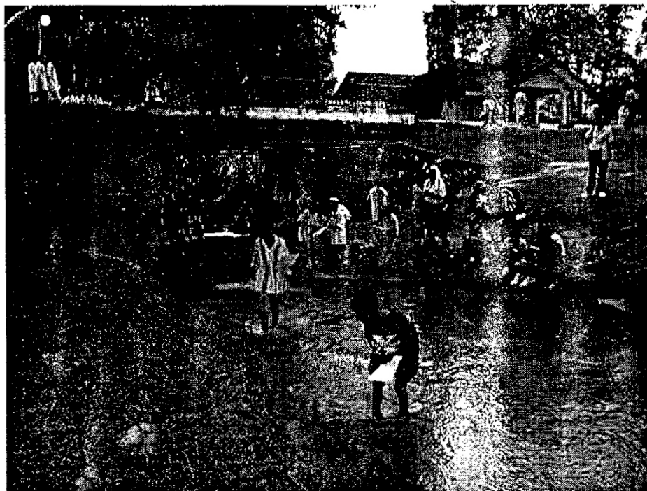
Plate 3: Teaching the local community to monitor and love their rivers – case of the Sg Air Terjun in Penang, Malaysia.

participants with ages ranging from 3 to 60 took part. The president led the group in the "River Walk" along the banks of the Sg Air Terjun (a tributary of the Sg Pinang) (Plate 3).