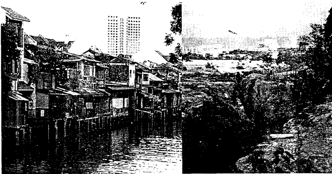
Plate 1: Left - Squatter houses along the Melaka River, Malaysia. Right - Deforestation caused by land development in the Penang Hill in Penang State, Malaysia.