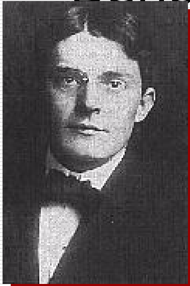
John Watson (1878-1958)

Scientific Psychology should focus on observable behavior.