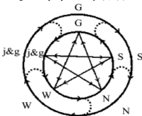
Figure 1: Interrelationship of variables of economic growth and the chain reaction thereof, (Source: Chapra, 2006).

"the development or decline of an economy or society does not depend on any one factor, but rather on the interaction of moral, social, economic, political and historical factors over a long period of time. One of these factors acts as the trigger mechanism and, if the others respond in the same direction, development or decline gains momentum through a chain reaction until it becomes difficult to distinguish the cause from the effect."