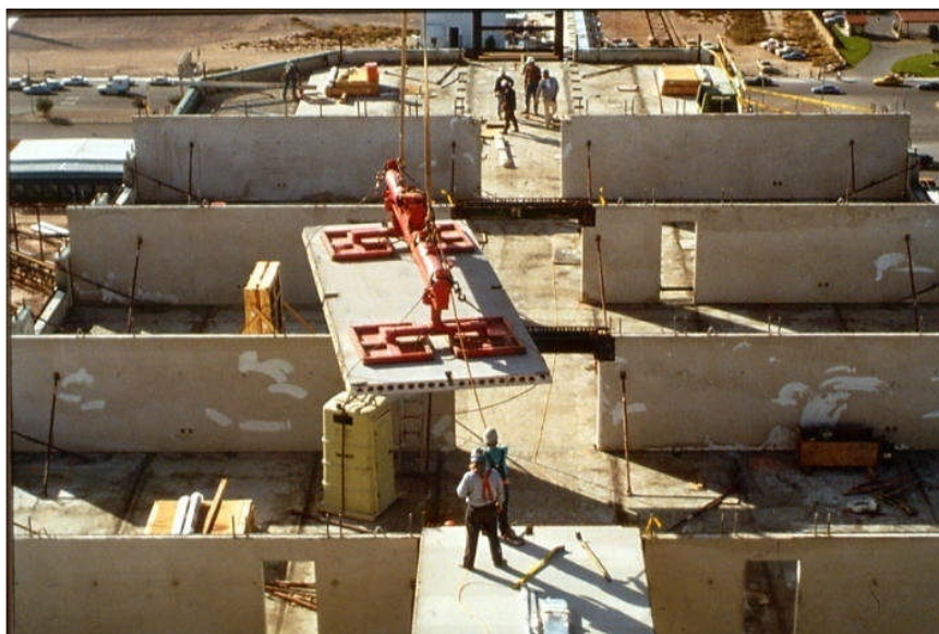
Figure 1.1: Applications of precast concrete structures in a building construction

Nowadays, some modifications can be made by varying the materials used in the casting of concrete topping. This include an application of steel fibre reinforced concrete (SFRC) as structural topping that is possible in resulting better horizontal shear strength between the precast slab and concrete topping without providing any interface shear links. Hence, by understanding the material properties of SFRC including its overall effect to the strength of composite slab and the development of the horizontal shear strength is the main finding in conducting this study.