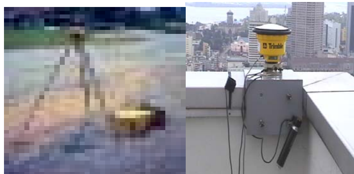
Figure 5: Base 2 (B2) and Rover 2 (R2) Stations