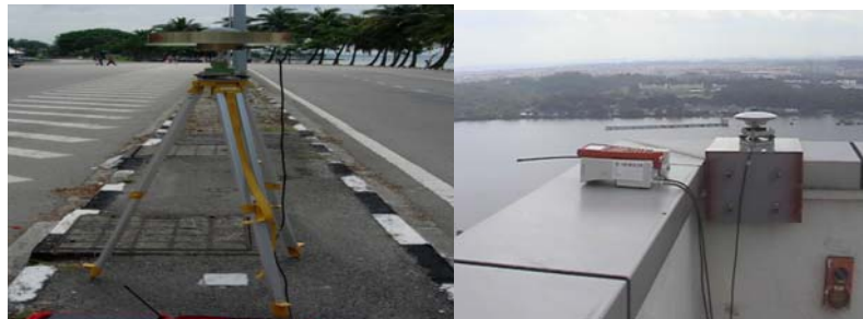
Figure 4: Base 1 (B1) and Rover 1 (R1) Stations

Two different types of GPS instruments were used to carry out Real Time Kinematics (RTK) GPS observation. Two set of Leica and Trimble instruments were set up at monitoring station and reference station respectively. Therefore, the GPS survey was took one hour with this observation procedure. The stability of high rise building is determined by using modern GPS observation technique, continuous Real Time Kinematics (RTK). The period of the observation is within 1 hour which involved two base ( B1 and B2) and two rover (R1 and R2) – see Figure 4 and 5. The study uses 2 monitoring stations (2 Rovers) which is located on both side of the building's rooftop. It can improve the strength of monitoring network. In other words, if R1 detect the vibration and it can be proven by another rover, R2.