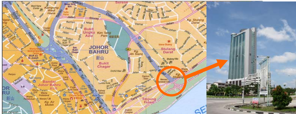
Figure 3: Menara Sarawak Enterprise

Two different types of GPS instruments were used to carry out Real Time Kinematics (RTK) GPS observation. Two set of Leica and Trimble instruments were set up at monitoring station and reference station respectively. Therefore, the GPS survey was took one hour with this observation procedure. The stability of high rise building is determined by using modern GPS observation technique, continuous Real Time Kinematics (RTK). The period of the observation is within 1 hour which involved two base ( B1 and B2) and two rover (R1 and R2) – see Figure 4 and 5. The study uses 2 monitoring stations (2 Rovers) which is located on both side of the building's rooftop. It can improve the strength of monitoring network. In other words, if R1 detect the vibration and it can be proven by another rover, R2.