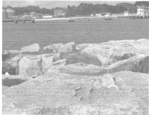
Figure: 1 – One of the Monitoring Station (BW4)

The monitoring of nine (9) control points was carried out using the latest- state-of-art GPS. These include six (6) monitoring points on the South Breakwater (SBW), i.e. points BW1, BW2, BW3, BW4, BW5 and BW6. These monitoring points have been established by previous consultant surveyors – see Figure: 1. The GPS control network was established using three GPS receivers, Leica System 300. This GPS receiver measures range, range rates and signal phase at the antenna and compute position, velocity and time. The objective of GPS surveys is to determine coordinates of monitoring stations located along the South Breakwater. For this purpose, three (3) GPS control stations located on shore area (stable areas) were established as reference control networks for present and future GPS survey. The stations are GPS01, GPS02 and BWC (see Figure: 2) c . Both GPS01 and GPS02 stations were tied to National GPS Network, i.e. P226 station for duration of more than 1 hour observations. At each control points, GPS observations were carried out for at least 20 minutes for the six monitoring points using all three GPS control stations, i.e. GPS01, GPS02 and BWC . During GPS observations. The Position Dilution of Precision (PDOP) of less than 5 is being maintained. It was believed that geometry yielding a low PDOP would yield the best results.