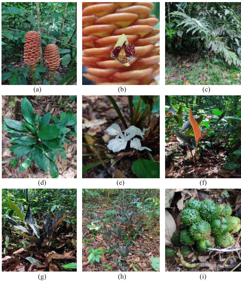
Figure 3. Zingiberaceae in Labis Forest Reserve. (a–c) Zingiber spectabile (left to right) inflorescence, flower, habitat, (d–e) Scaphochlamys klossii var. glomerata , (f–h) Zingiber malaysianum , and (i) Fruit of Meistera aff. ochrea