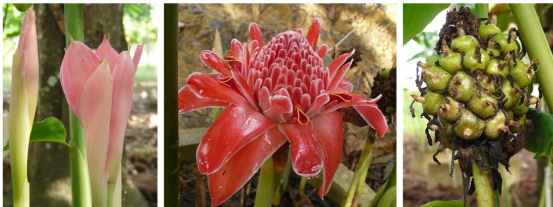
Figure 1. Inflorescence (pink and red) and fruits of torch ginger