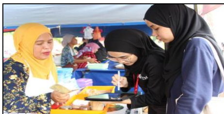
Figure 3.2: Analysis Phase

To determine particular difficulties and knowledge gaps, a needs assessment of the hawkers and the neighbourhood was carried out. The existing skill levels, business procedures, and digital literacy of the hawkers were simultaneously understood. The goals for incorporating service-learning pedagogy and 21st-century skills into the project management curriculum were established using the evaluation as the basis.