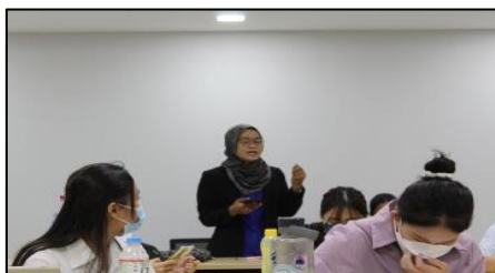
Figure 3.3: Design Phase

The programme structure and learning objectives were created based on the analysis. The events, modules, and assessments that matched the project's goals were organised in a certain order. The 4Cs (Critical thinking, Creativity, Collaboration, and Communication) integration into various project phases was also established.