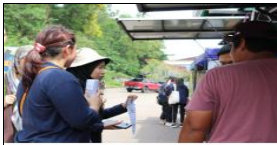
Figure 3.4: Development Phase