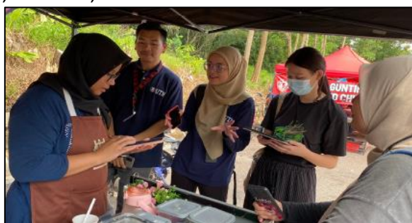
Figure 3.6: Evaluation Phase

Students' skill development and the program's effect on participating firms were both regularly evaluated. For hawkers, improvements in revenue, online visibility, and client involvement were assessed. To pinpoint areas that needed improvement, feedback was obtained from students, hawkers, and collaborators.