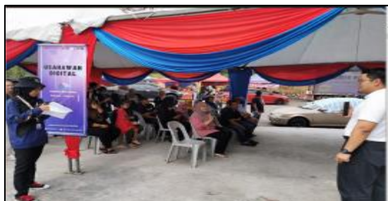
Figure 3.5: Implementation Phase

A clear plan for delivering the curriculum was followed during the execution of the Digital Entrepreneur Programme. For both students and hawkers, workshops, training sessions, and practical exercises were held. To promote cooperation and communication, interactions between students, hawkers, and other stakeholders were facilitated.