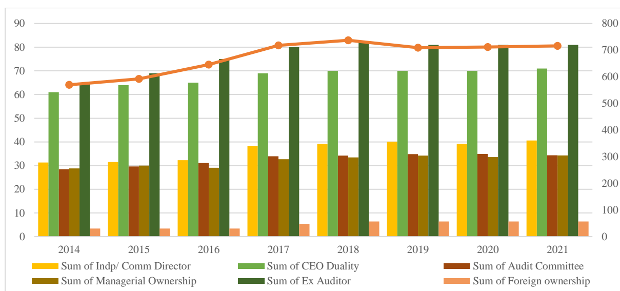
Figure 1.1 Corporate Governance Disclosure Breakdown

The results of the corporate governance findings from the analysed 91 listed companies show some interesting trends. The findings of the research of the seven characteristics of those listed corporations reveal certain accomplishments that spark intriguing debate to corporate governance. The overall findings (Figure 1.1) of these 91 companies show that they recorded a total of 12,987 entries over an 8-year period. In further breakdown, the board size entries recorded the highest attainment with a 5,400 entries or accounts for 41.58% of this sector. This is followed by entries resulting from independent committee / directors with an attainment of 18.76% or total entries of 2,436. Slightly lower than that, audit committee entries recorded a result of 15.87% with a total number of 2,061 entries. Records relating to managerial ownership of the listed companies recorded about 1,881 entries, which account for 14.49%, followed by entries relating to external auditors (4.73% or 614 entries), trailed by 540 entries from the CEO duality category of governance with 4.16%. The lowest attainment from the corporate governance sub-elements recorded by the categorization of listed companies in terms of their ownership only accounts for about 0.35%, or 46 entries.