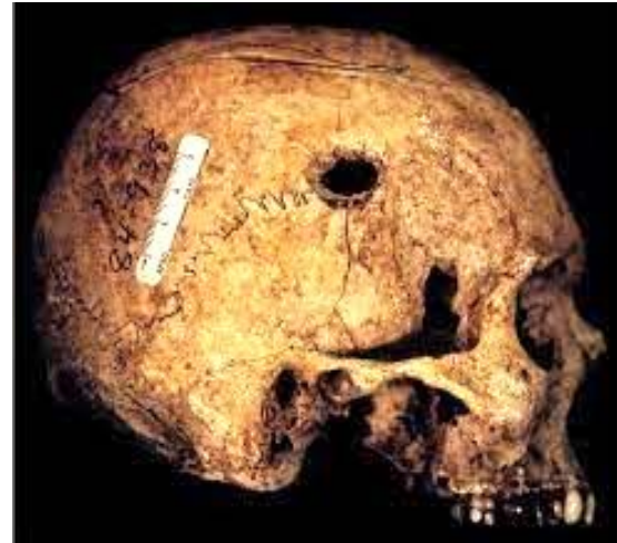
Figure 1. Examples of skulls or skeletal remains in a burnt condition

Sex classification is aimed at determining whether a given skeleton belongs to a male or female [3]. Knowledge about the sex of the body of an unknown collection is very important to make a more accurate estimate of the age [3]. Without an accurate sex determination, it will not be possible to accurately estimate the age at death. Thus, sex determination is necessary for further identifying the age, ancestry, and stature estimations [2].