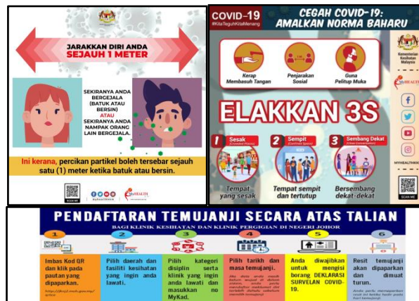
Figure 3: Various Infographics Which are Common in The New Normal