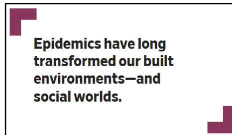
Figure 2: Statement on The Effect of Epidemics on Built Environments (Chang, 2020)