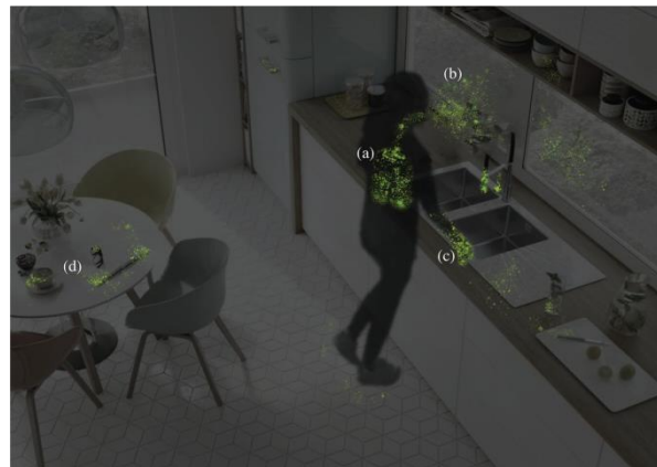
Figure 4: Conceptualization of Covid-19 deposition

Covid-19 had propelled authorities to restrict access to most public spaces and large areas, which could change the way they operate. Architects, planners, and built environment professionals are keen to examine many social and spatial implications to generate new patterns and configurations of use (Salama, 2020). Most architecture today shows evidence of how humans have responded to infectious diseases by redesigning our physical spaces to prevent Covid-19 deposition, as shown in Figure 4 below. Working from remote locations, learning online and shopping from e-commerce sites drives the focus on virtual access from smart devices (Goniewicz et al., 2020). Certain densely populated cities are vulnerable to the risk of infection (Chang, 2020). Working from home reduces physical contact but might pose a challenge for smaller and crowded houses without outside spaces (Saadat et al., 2020).