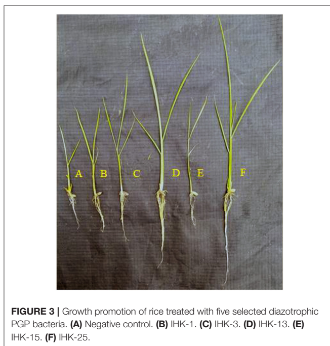
FIGURE 3 | Growth promotion of rice treated with five selected diazotrophic PGP bacteria. (A) Negative control. (B) IHK-1. (C) IHK-3. (D) IHK-13. (E) IHK-15. (F) IHK-25.

The efficient PGP bacteria can be used as biofertilizers, biopesticides and phytostimulators to improve crop yield, soil quality and control phytopathogens. As a result, agricultural-based research mainly focuses on the rhizosphere, which has a diverse microbial community (22). In this study, a total of 15 bacteria were secluded from the rice rhizosphere on a combined carbon/ Rennie medium. Combined carbon medium provides the greatest populations of putative diazotrophic bacteria from rhizospheric soils (25, 26).