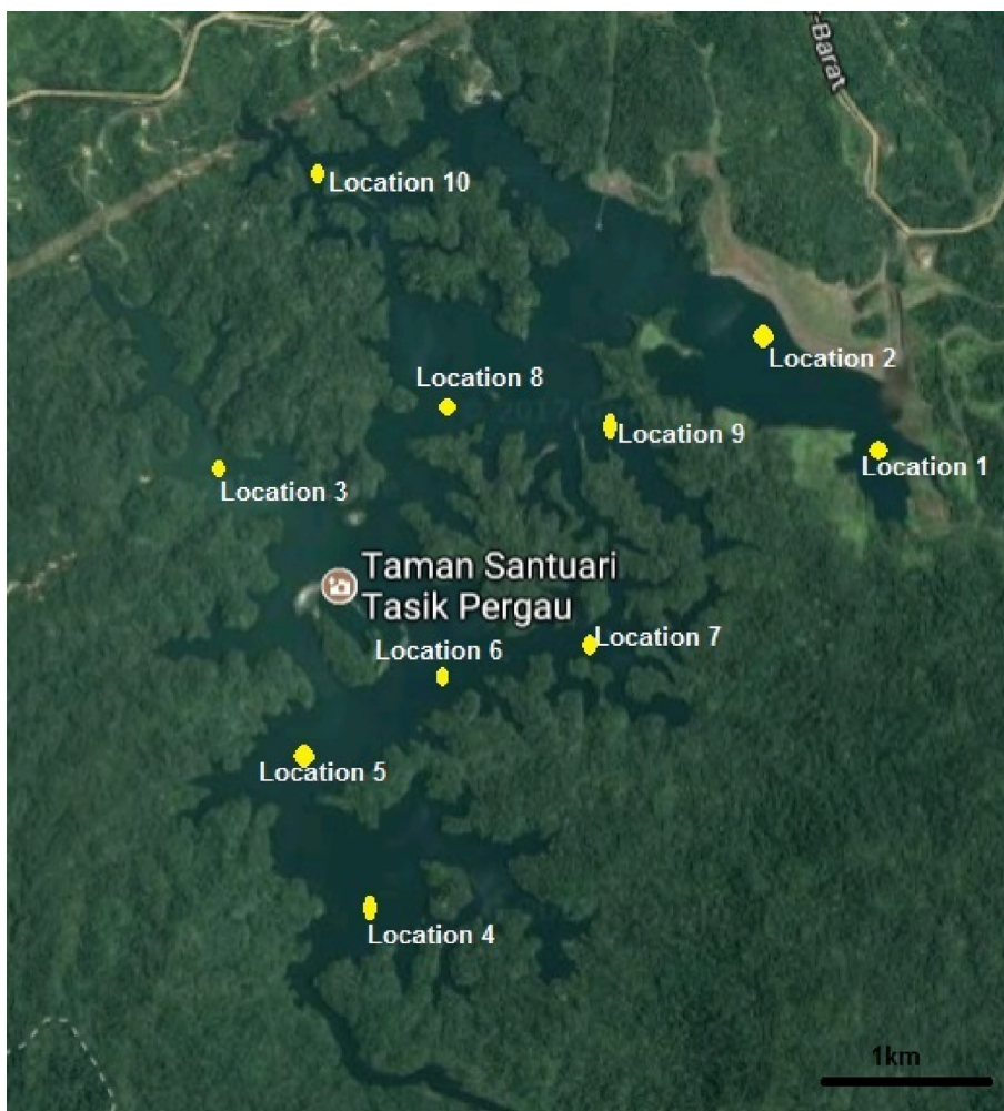
Fig. 1. Study area in Pergau Lake.