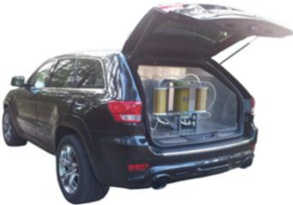
Fig. 1. HPEMcarStop [23]