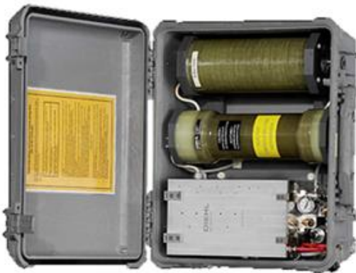
Fig. 3. HPEMcase [23]

As shown in Fig. 3, the HPEMcase is optimized to disable electronic equipment for special forces operations. The HPEMcase has a maximum power of up to 365 MW and a total explosive length of up to 60 seconds at a center frequency of 350 MHz [23]. HPEMcase is also used as an EMP source in-field testing to determine the impacts of an EMP pulse on vehicle testing [24], [25].