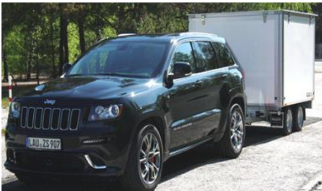
Fig. 2. HPEMcheckPoint [23]