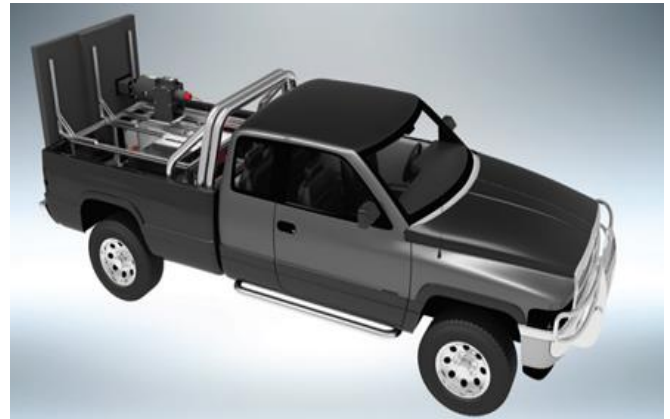
Fig. 4. RF Safe Stop (Land) [26]

Safe Stop (Sea) system can be used for port security, coastal policing, and anti-piracy operations. RF Safe Stop (Sea) is a modular system that allows reconfiguration to suit the platform. It uses an antenna size of 1 m 2 and has a stopping distance of 50 m. Third, RF Safe Stop Lite (Sea) with the same application as RF Safe Stop (Sea) but is different in terms of stopping distance (120 m), antenna size (1.5 m × 0.75 m), and weight (156 kg) [26], [27].