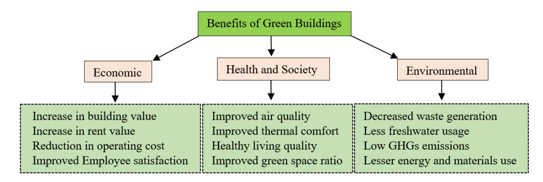
Figure 1 Benefits of green buildings

Globally, buildings account for 40% of energy and material use, 33 % of CO2 emissions, 25 % of wood harvesting, and 17% of freshwater usage (Say and Wood, 2008). Therefore, it is of utmost importance to plan and design new buildings and cities on the precept of sustainable development features, such as selfsustainability, zero waste/zero emissions, environmental safeguarding, and green fuel and energy exercise (Watson, 2019). Hence, there is a need for some stringent building codes and standards to stabilize these components. The implementation of these standards depends on the climatic and economic condition of that very nation. Generally, green buildings have a higher capital cost, which is about 2% more than conventional buildings, but in return, they give a life cycle savings of 20 % (10 times more than the initial investment). Various benefits of green buildings are shown in Figure 1. Due to the significance of green space in the cities, there is a trend of studying and working on the aspect of Urban Green Space (UGS). The importance of UGS in the survival of healthy cities during the pandemic is summarized in section 4. While some of the trends of green buildings and cities are depicted in Figure 3.