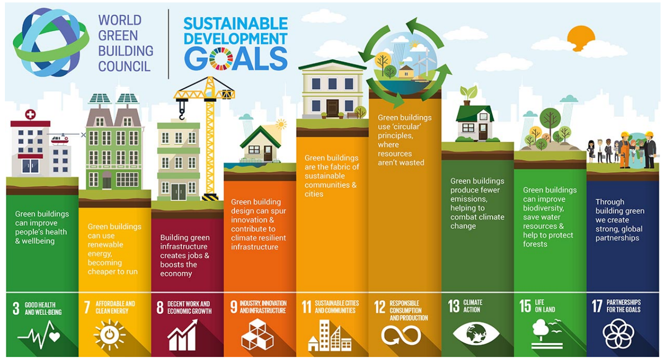
Figure 2 Sustainable development goals contributed by Green Buildings (Council and Council, 2016).

was founded in 1998 and now it has spread its establishments to 12 countries. Green buildings contribute to 9 out of 17 SDGs, as shown in Figure 2. However, in the establishment of green buildings and cities, it is important to integrate the aspects of energy production and treatment/recycling of wastewater/ CO_2 . This will lead to multi- benefits in terms of sustainable energy, environment, and individual well-being. In this regard, researchers have been studying the suitability of algae to be the potential contender for the same purposes.