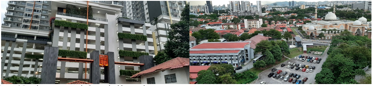
Figure 3 Revolutionizing trend of green buildings and green towns in Kuala Lumpur.

Algal-based green communities are trending and introduced in many countries, while it is predicted that algae are having immense potential to suffice long-term future demand of energy and food in an environmentally sustainable manner (Vassilev and Vassileva, 2016). Algal green communities will lead to the mitigation of pollution (greener environment), conservation of natural resources (fossil fuels), and a vibrated economy. This study is based on the literature review of the recent research and